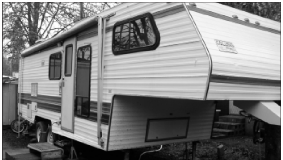
Temporary dwelling or permanent home?

Well, it was as though the Barkers had opened a flood gate of generosity, continued on page 2