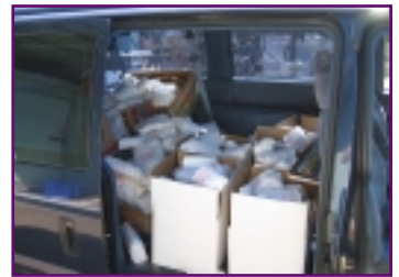
What does a ton of meat look like?