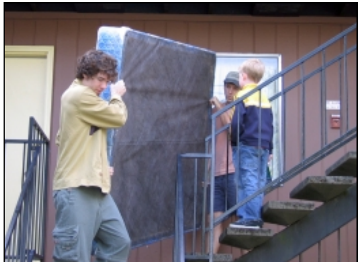
Love INC volunteers get the job done!